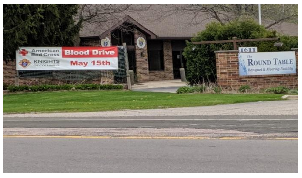
Council 4897 Sun Prairie COVID blood drive